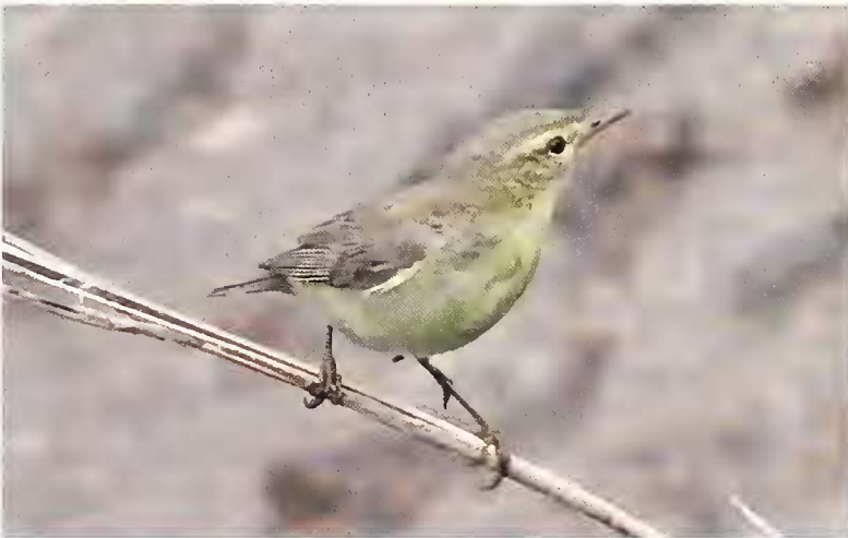
Plate 13. Willow Warbler Phylloscopus trochilus , Mount Mariveles watershed, Bataan, Luzon, 15 October 2015.